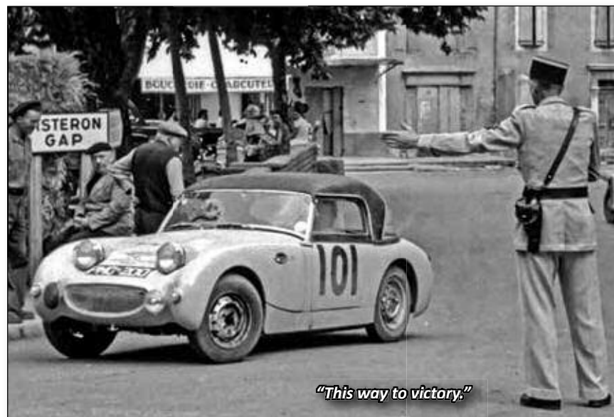
"This way to victory."

Converting the car back to right-hand drive (RHD) required sourcing a RHD dash and steering "plinth" from a California Sprite owner who abandoned converting his car. A Morris Minor left-hand drive (LHD) steering rack was acquired from a gentleman in Arizona by placing a classified ad in a Morris club newsletter. The LHD Minor rack was used on RHD Sprites by flipping it upside down. Lucky the Brits built cars from parts bins! It was not uncommon to use up last year's inventory on next year's model. An easy way to help control costs and use up old parts, but 50 years later it is the source